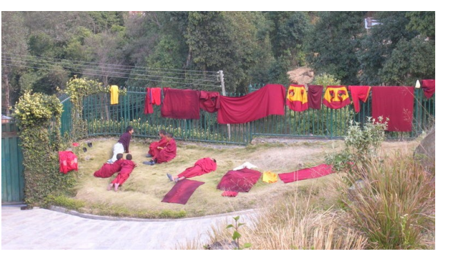
"Washing Day" for the monks at Kopan