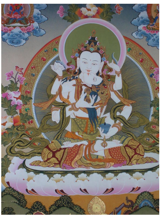
Vajrasattva Thangha in our retreat room at Kopan

I left on January 8th excited and a little apprehensive. I had so much luggage that I had to unpack one bag at check-in, and put some of my stuff in my carry-on bag. I pleaded with the woman at check-in to let my bags go, without charging me big bucks. I almost begged her—saying, "I am going on a spiritual retreat, I am a minister (yes, I used the minister card), I am going into a monastery." She rolled her eyes and let me in without extra charges. When I