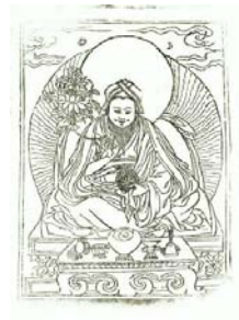
Lama (Teacher). Unidentified. Eastern Tibet. Item No. 87650.