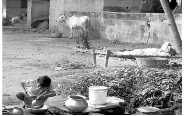
Bodhgaya Homestead.

Transcendence is different from transformation. The path of transcendence can be pursued with a closed heart: I can ignore poverty, war, stress, loneliness, oppression and other earthly problems. I'm not trying to fix things. I'm rising above them. I can even close my heart to myself. I don't want to get sucked into my physical and